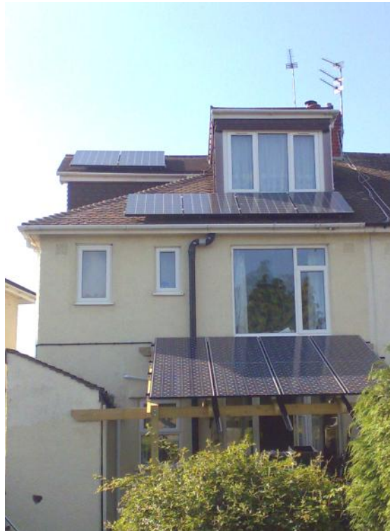
Fuel falling from the sky

3.3kw Solar panels, and the rest comes from a renewable source. Next month we get our Nissan Leaf 5 seat, 110hp, 110mile range, electric car and can give up fossil fuels for cars completely.