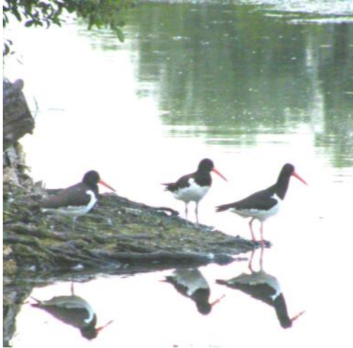
Oystercatchers at Radley lakes