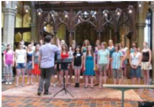
The choir during rehearsal at St Helen’s Church