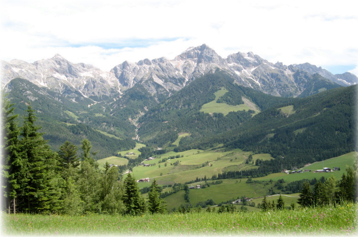
Backdrop for a Communion Service

Here's a question: what do a psychologist, a flight attendant, an optician, a horticultural engineer, a carpenter, a forester, an innkeeper, a dentist, a wood carver and a lawyer have in common? Answer: they are all residents or natives of the Bavarian village of Oberammergau, who have set aside their normal lives to take part in the 2010 Oberammergau Passion Play. The story of Oberammergau is of course well known: in 1633 the village was beset by plague and the villagers vowed to perform a Passion play every ten years if God would spare them. The first play was performed in 1634, and has continued ever since. To take part, you must have either been born in Oberammergau or lived there for at least twenty years.