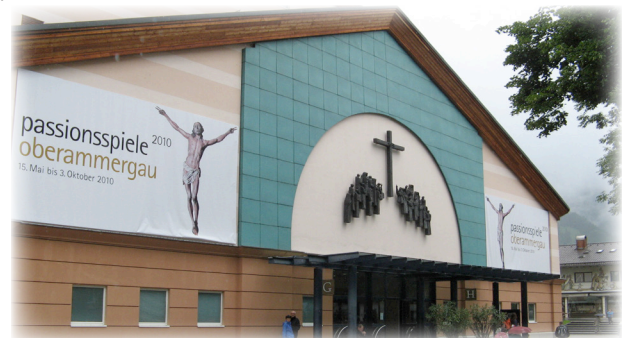
Passion Play Theatre

It's probably too late to go this year, but start planning for 2020!